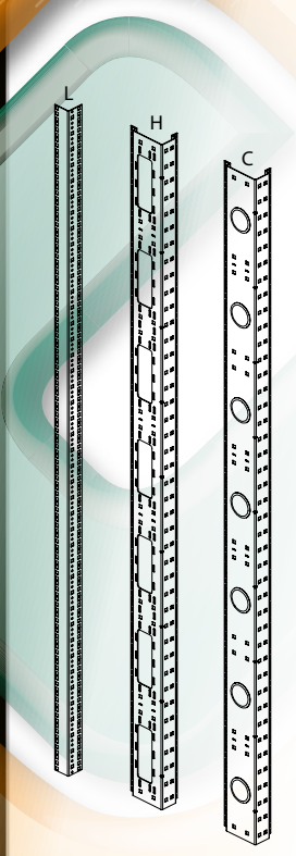
Basic right extrusion types