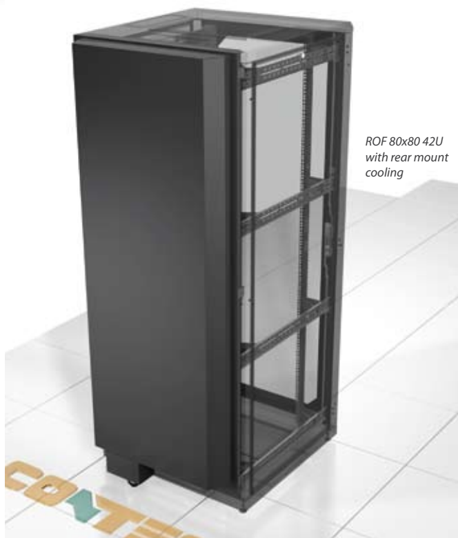
ROF 80x80 42U with rear mount cooling

The rear mount cooling units with a closed circuit are ideal for cooling of hot spots - extremely hot local points in the rack vicinity. Therefore, they can be used not only in newly established data centers, but in older centers as well, where increased output of the equipment installed results in a problem concerning sufficient cooling of hot spots.