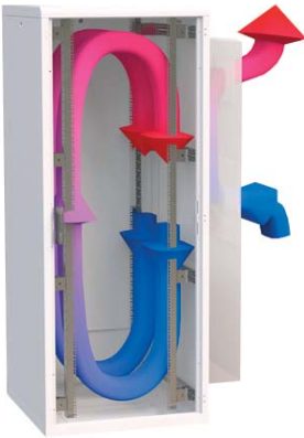
AIR FLOW THROUGH THE RACK – COOLSPOT DX WM VERSION